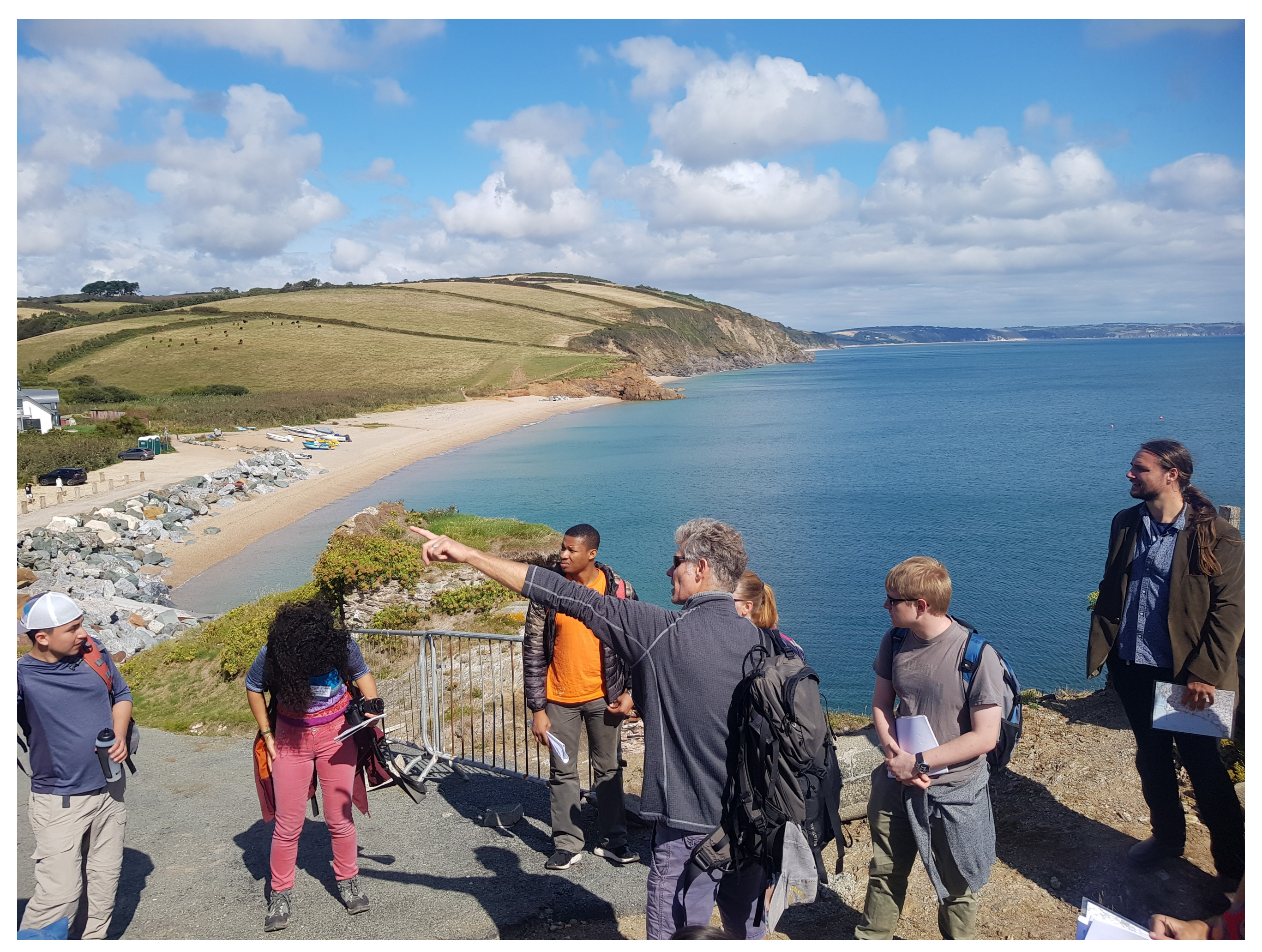
A guided walk around Start Bay in 2019. Irresponsible, commercial sand dredging in the early 20th century in Start Bay lead to coastal erosion which destroyed the village of Hallsands in 1917.

The South Devon Rivers region runs from Wembury to Seaton with a focus on the tidal reaches of the Rivers Exe, Teign and Dart. Between 2019 - 2020 we collaborated with local groups to record and better understand the wide range of archaeological features on these rivers, including abandoned boats and barges, the remains of coastal industries and lost prehistoric landscapes.